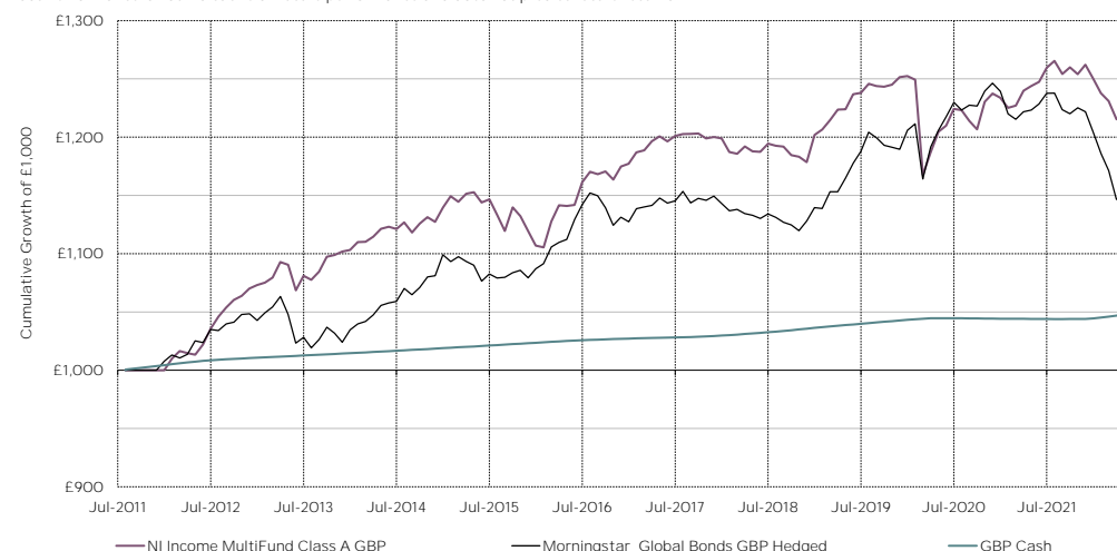
Class A GBP monthly returns and cumulative growth of £1,000

Past Performance is not indicative of future performance and does not predict future returns